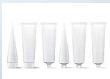
PE & PBL Tubes