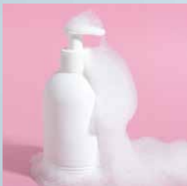
Shampoo & Conditioner