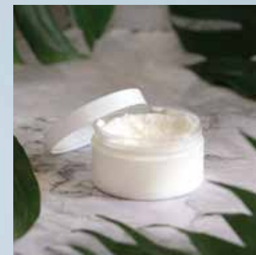
Body Butter & lotions