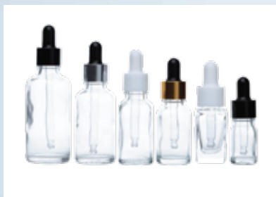
Glass dropper bottles