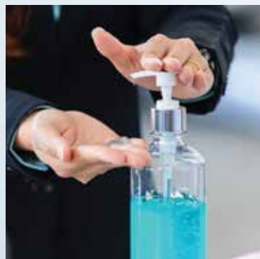
Hand wash & Sanitizer