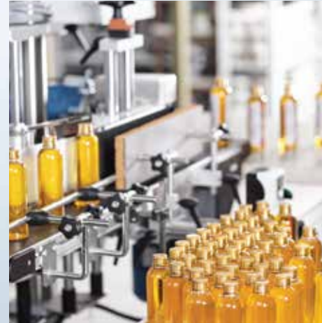
Filling & Co-Packing