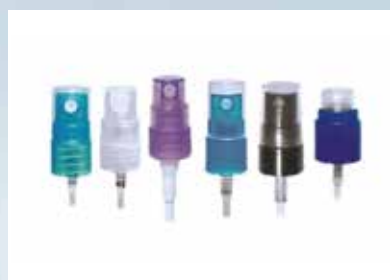
Mist Spray pumps